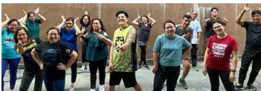
Zumba fitness class - Philippines