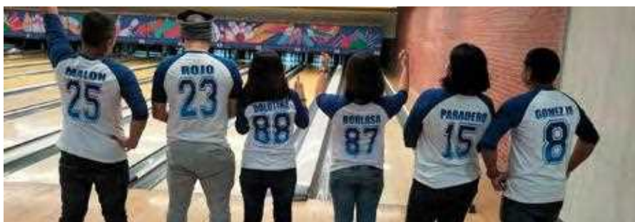
Sportsfest Bowling - Philippines