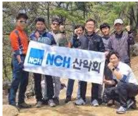
NCH Korea Culture Club (Mountain Climbing, Movie club)