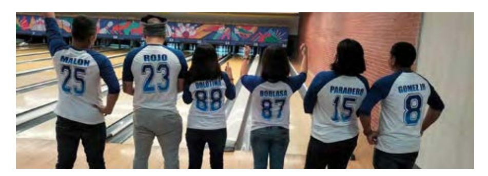
Sportsfest Bowling - Philippines