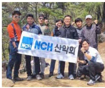
NCH Korea Culture Club (Mountain Climbing, Movie club)